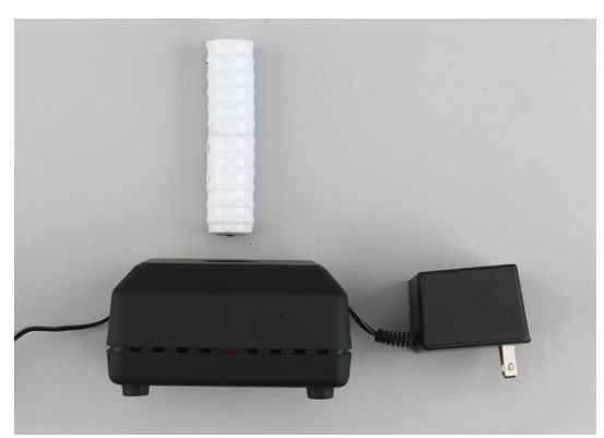
Figure 3 Nicad Battery Charger

<u>Caution:</u> Do not use around water. Do not allow the charger to get wet. Keep the charger on a clean, dry area and insure that dirt, dust, and foreign objects are kept out of the hole and off of the charging contacts. <u>Do not try charging any other battery except the AVID supplied NiMH battery.</u>