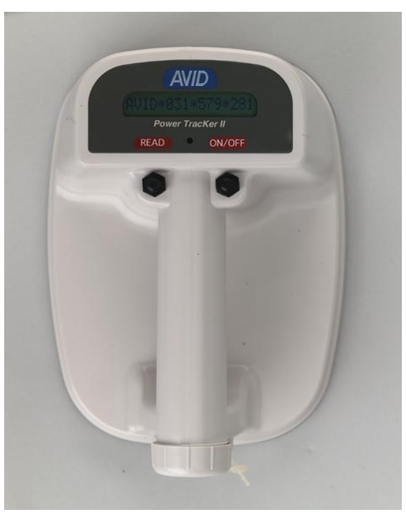
Figure 1 Power TracKer

Power TracKer II reads AVID and Fecava coded tags.