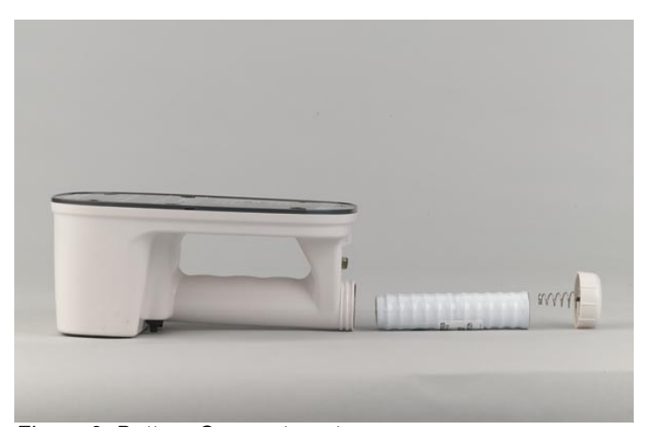
Figure 2 Battery Compartment

The BATTERY Compartment is located on the back of the reader. When you do not intend to use the reader for an extended period of time, remove the battery and store the reader and battery in a dry location protected from sunlight, high heat and humidity.